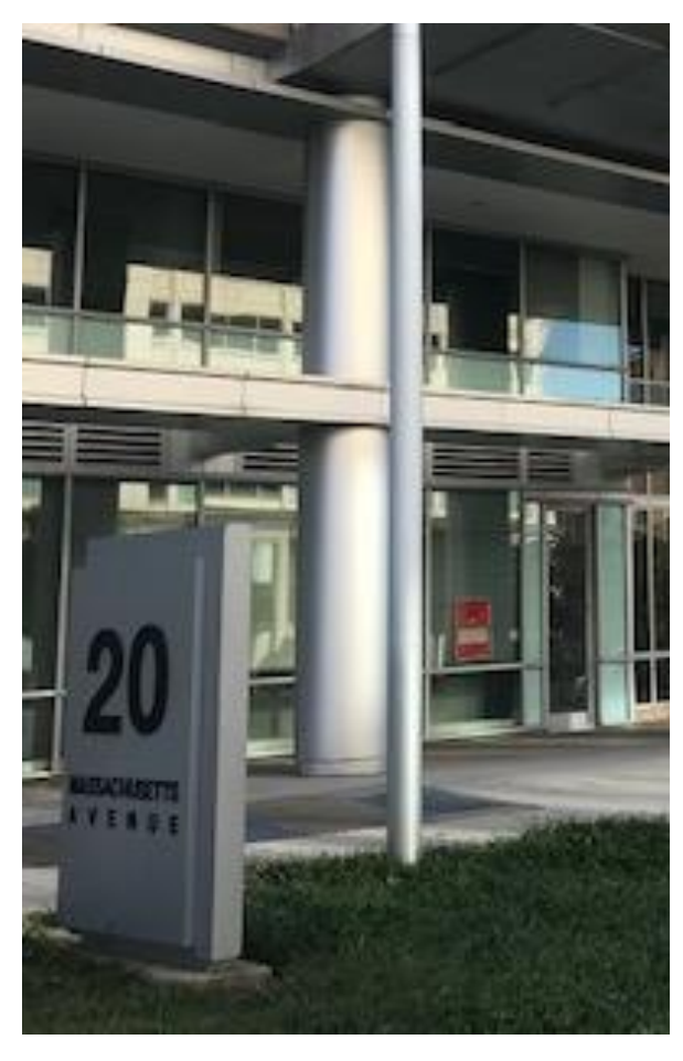
1. 10/16/2020 Massachusetts Avenue NW